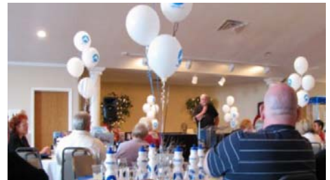
Annual Meeting 2009—Everyone enjoyed an informative and entertaining event.

Be sure to call or visit your closest NPCCU branch to sign up your family for the Membership Appreciation Picnic and Annual Meeting today!